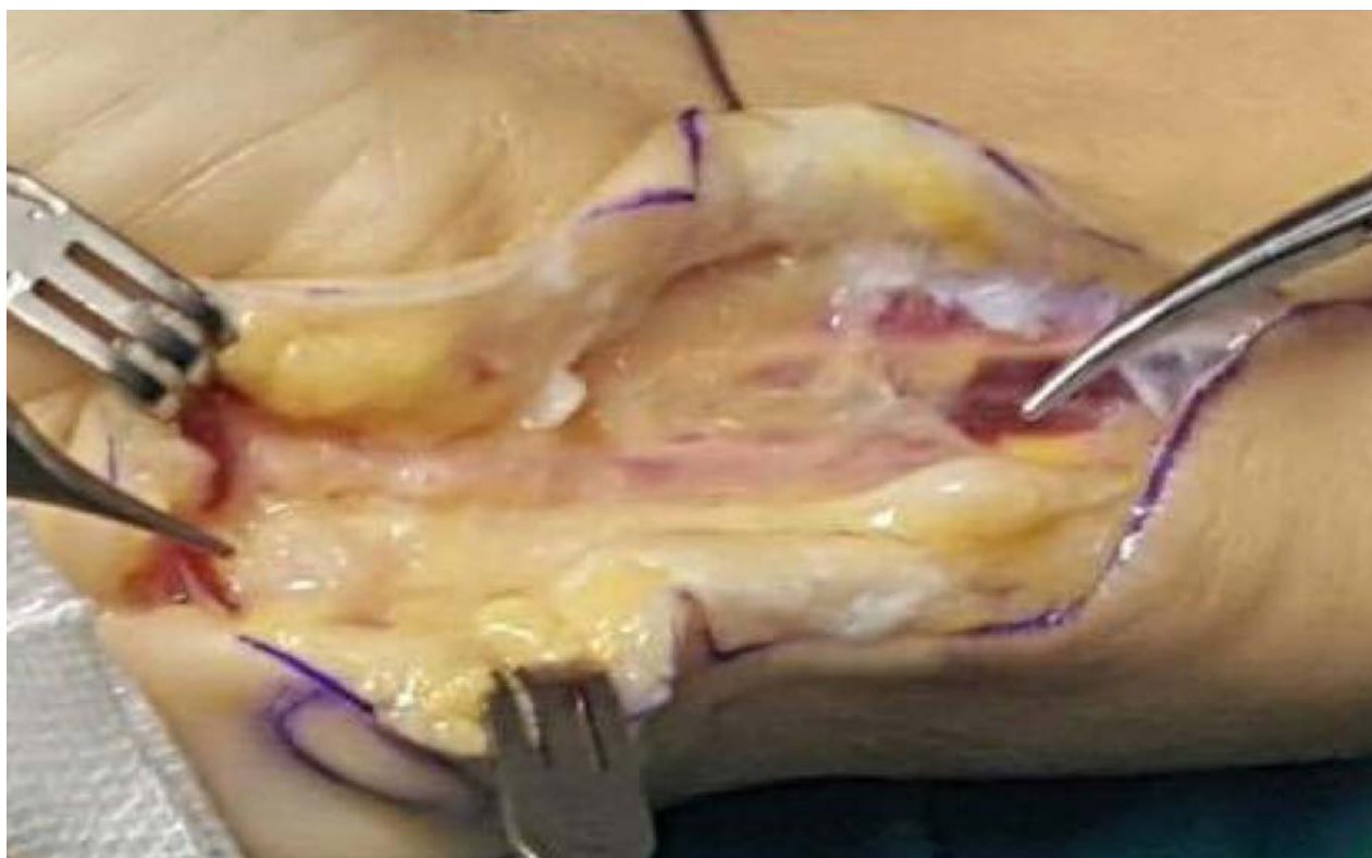
Figure 2. Intraoperative picture of the right fist with changes in the ulnar nerve in the distal forearm and in the Guyon channel area